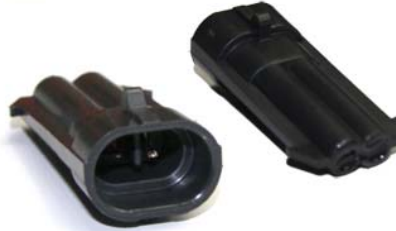
Front & Rear View